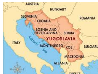
Map/ Image C